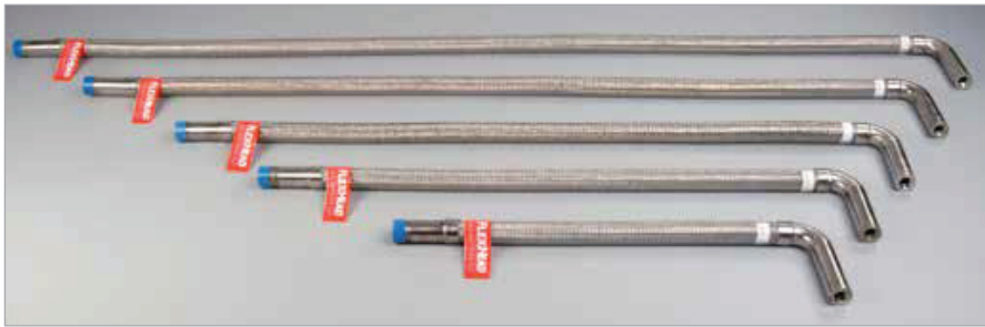
Fig. 20XXET Tall Elbow Hose