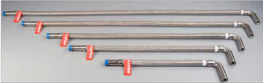
Fig. 20XXHE High Pressure Elbow Hose