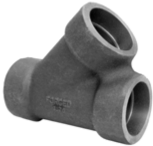
Figure 2158 Laterals