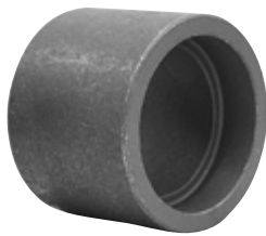
Figure 2175 Half Couplings