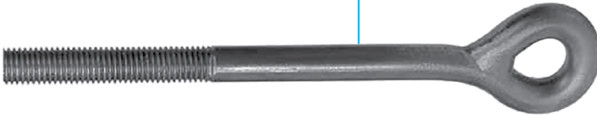
Fig. 278L: Left Hand Threads

Fig. 278: (Formerly Afcon Fig. 681): Right Hand Threads