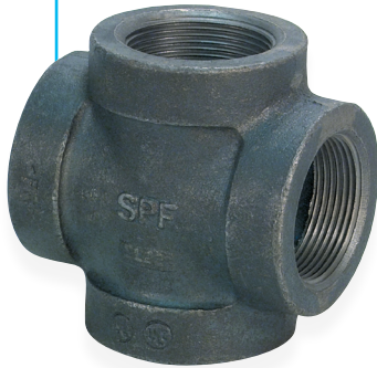
Cross Fig. 3207