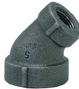
Fig. 356R 45° Reducing Elbow

Note: See first page for pressure-temperature ratings.