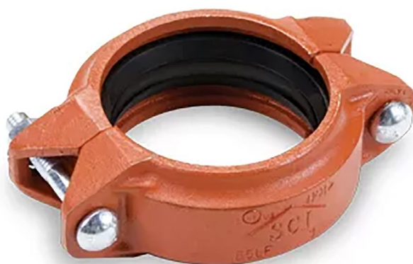
Figure 65LFTRI & 66LFTRI Lightweight Flexible couplings are designed for use in piping systems where flexibility is desired. They allow for pipe movement caused by seismic action and thermal variations, and will also attenuate noise and vibration transmitted through the piping system.