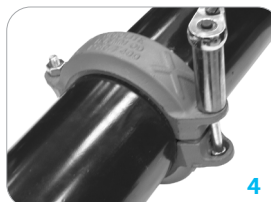
Maximum Bolt Torque

Notice: Uneven tightening may cause the gasket to pinch. Gasket should not be visible between segments after bolts are tightened.