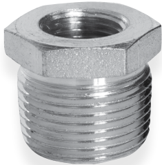
Figure 383STL Hex Bushings