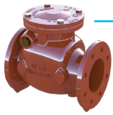
UL/FM Flanged, Grooved & Wafer Check Valves