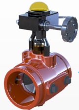
UL/FM Grooved & Wafer Butterfly Valves