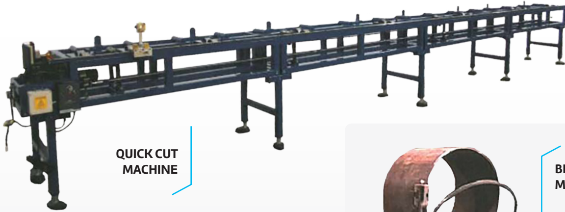
QUICK CUT MACHINE