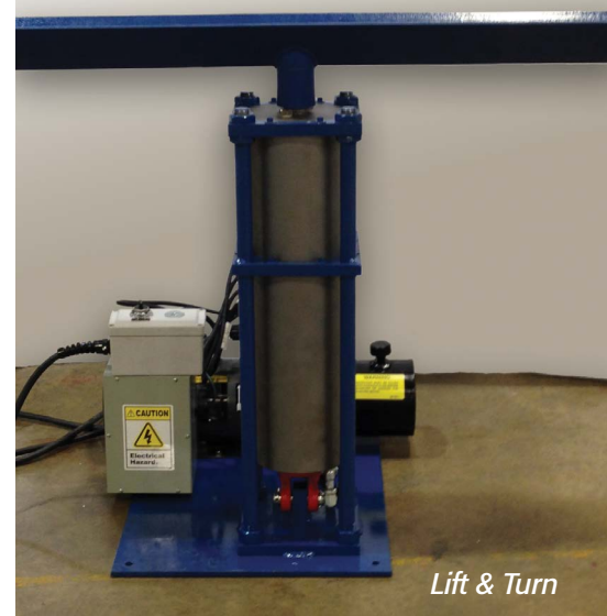
Lift & Turn