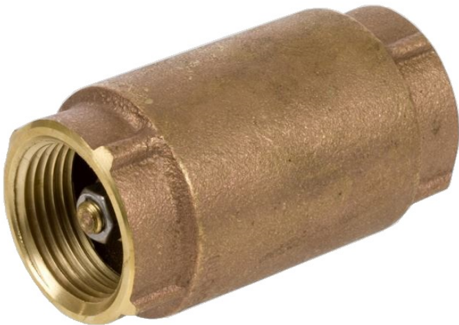
CV30 / CV30L Threaded Ends