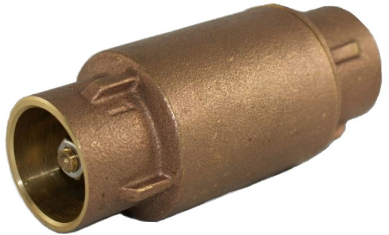
CV35L Sweat Ends