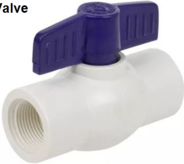
Series 9521 Threaded PVC Ball Valve