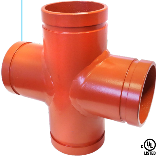
Cross Fig. X-1